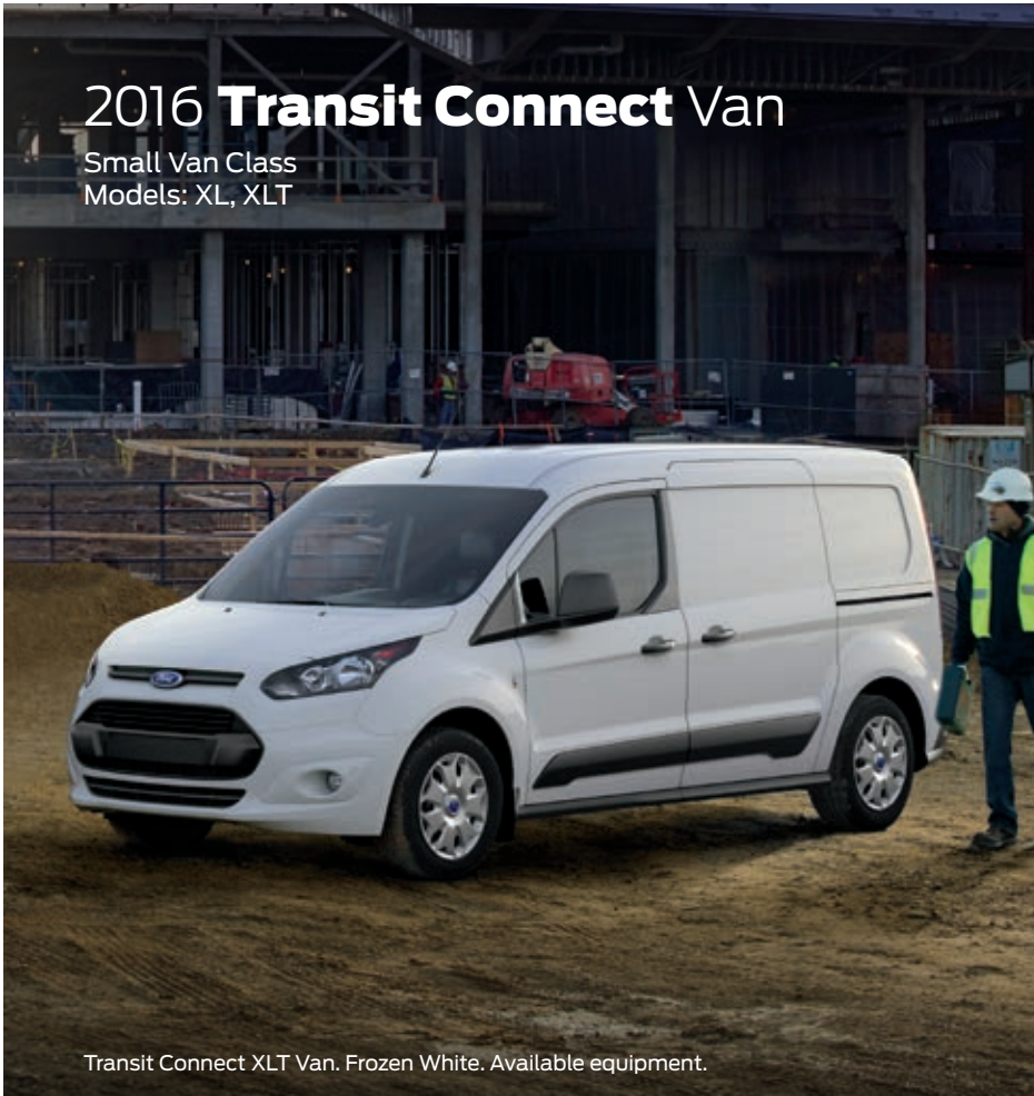
Transit Connect XLT Van. Frozen White. Available equipment.