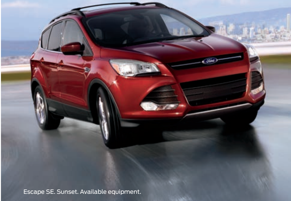
Escape SE. Sunset. Available equipment.

Small Utilities Class Models: S, SE, Titanium